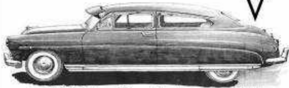
1949 Hudson Super Six Brougham

This calendar features renderings of Hudson made automobiles from 1915 to 1956 by Fred Mertlich, line artist of the HMCC Administration building that sold for $500 at the Detroit national meet. Each month features a large, beautiful drawing of a Hudson made automobile, as well as small color photographs of HET Club members' cars of the same era.