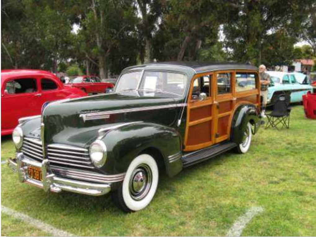
1942 Hudson Super Six Station Wagon