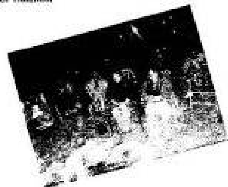
Right: Campfire Kids