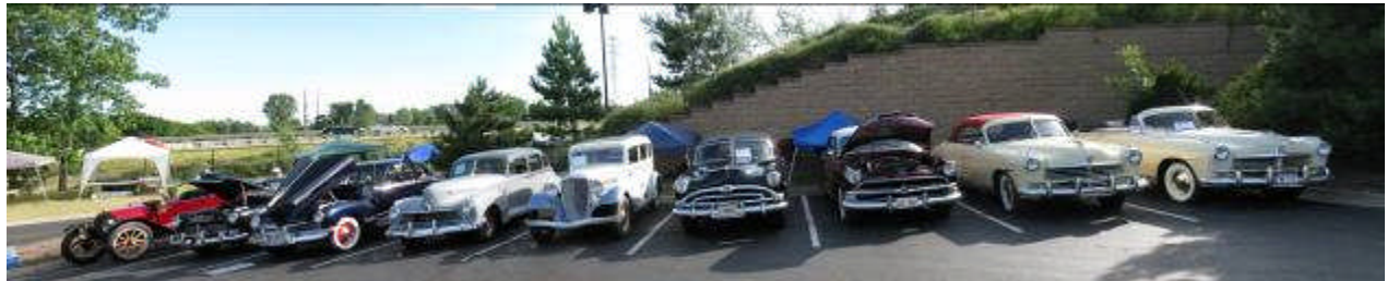
Albright Award Candidates