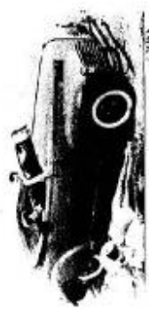
Which way to San Simeon?

Hot Dogs! Camp Fire Tales! Antiquing, Sight-seeing, Quilting, and best of all.....Tire Kicking!! Wondering what to do with all your free time after the National Meet? The San Simeon Lodge is located on the California Coast between Santa Barbara and Monterey. From either the North or the South, the drive in is spectacular. Slightly north of The Lodge is Hearst Castle, one of the wonders of the modern world. Directly south is the quaint village of Cambria. Cambria is a major art center as well as offering a diverse assortment of quilt shops, fabric boutiques, exceptional restaurants of all types, and antique shops galore!! Added to these attractions is the fact that the San Simeon Lodge is very car-friendly. We have a huge swap meet area which, besides cars and parts, hosts the Silly's hot dog feed on Friday and Saturday. After dark the area comes alive as Hudson Folks gather around the compite to continue the day's tire-kicking and catch up with old friends. Saturday night will be the banquet at the CavalierRestaurant, right on the ocean, then Sunday it's farewell to friends old & new until next year.