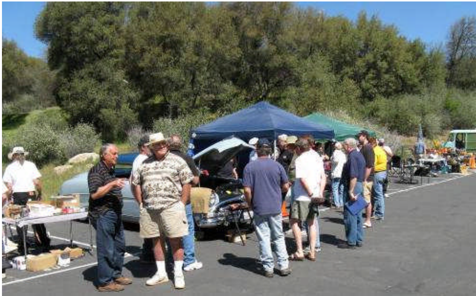
Western Region Swap Shopping

The raffle tickets will be $1 each or 6 for $5. I recommend that you put your name and contact information on the stub that goes in the container. Tickets will only be available at the National and a new raffle will be started each Day, Monday July 13th thru Friday July 17th. The Drawings will take place every day between 6 and 7 PM. Proceeds will be used to cover the cost of the Banners and any profit will go to the Yankee Chapter. We will need volunteers to work the table selling tickets each day. Thank you in advance for any help you give on this project.