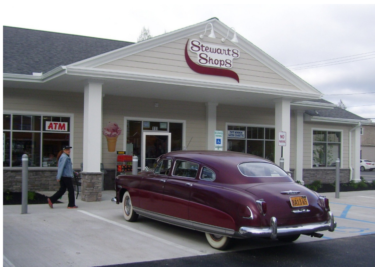
Opening Day at the new Stewarts Shop in Northville, NY