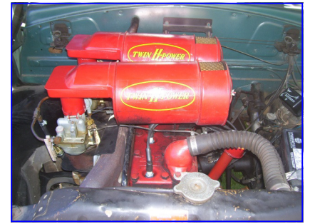
The GO end

My 53 Super Jet was pulled out of a field South of Galt, Ca in 1984. I paid $400 for it. The car was in grey primer with the roof sanded and had surface rust, the single carb motor was stuck and there was no rust in the rockers, or quarters.