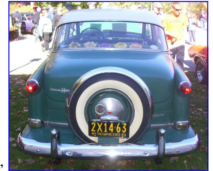
The Loud end