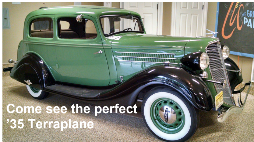
Come see the perfect '35 Terraplane