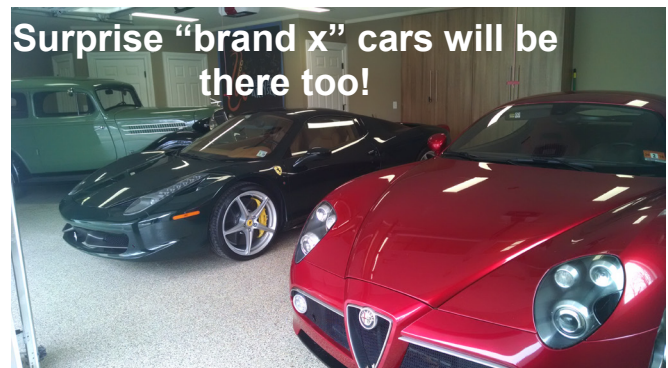
Surprise "brand x" cars will be there too!