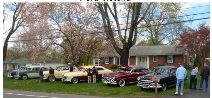
Members and guests inspecting the Hudsons