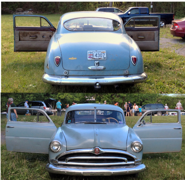
Pacemaker prepares to "take off" from the Skyline Caverns