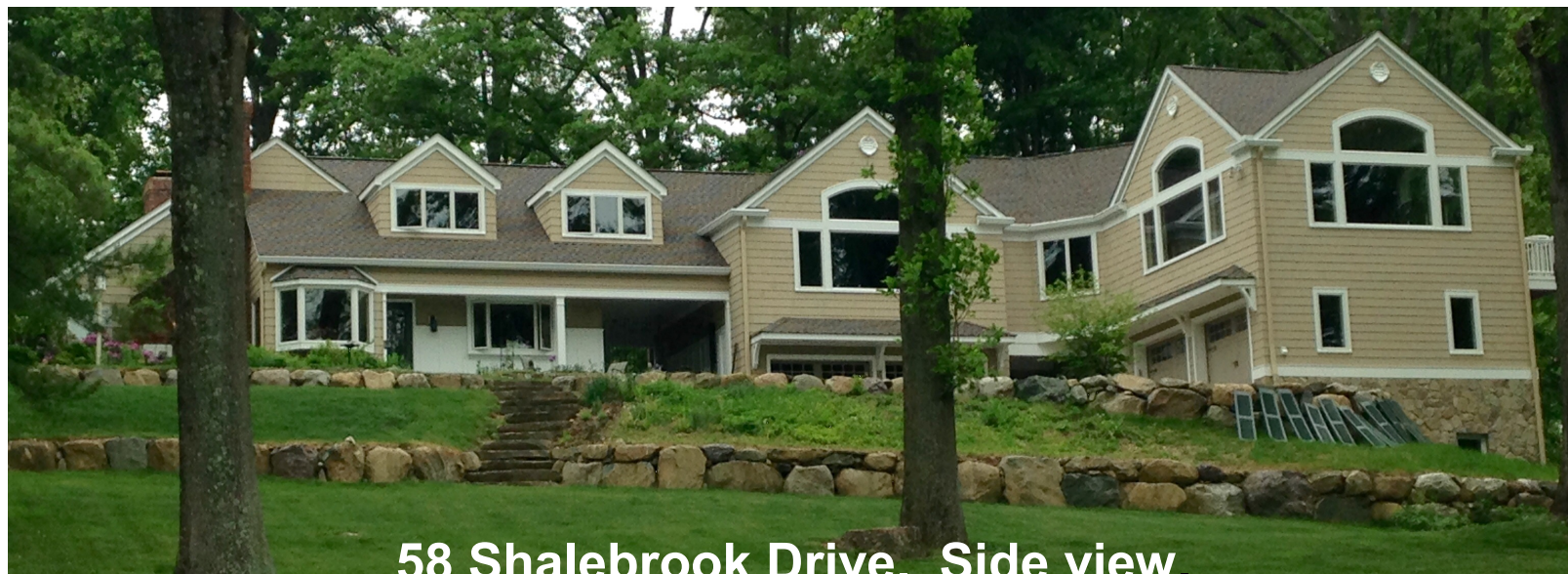
58 Shalebrook Drive. Side view. Hudson garages are on the lower right.