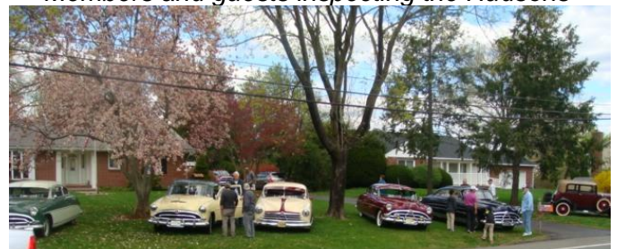
Passerby's stopped to look at the cars