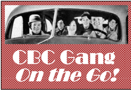
Aside from the fist item, Gang concentrates on CBC members at the National.