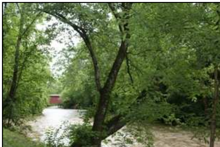
Barely visible, in the photo, Martin's Mill Covered Bridge

The oldest vehicle on the tour was the 1928 Hupmobile. The largest number of Orphans came from the Studebaker family, including Avanti and trucks.