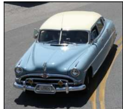
Above photos from the Eastern Regional.