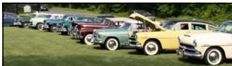
Just some of the Hudsons at the Skyline Caverns at Doc's Meet.