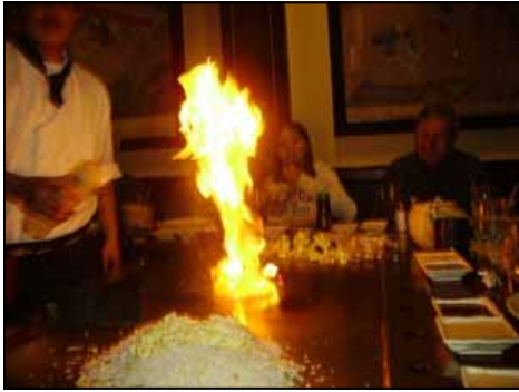
Our Chief shows off his style!