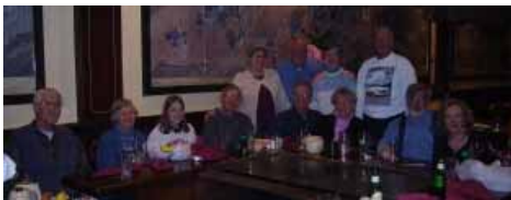
The group gathered around the hibachi table.

Prior to dinner, we enjoyed socializing and doing the things that CBC members excel at –Sushi for one, the bar for a few and the usual Tire kickin'. Stories of Brand X troubles and mysteries solved were shared. And a good time was had by all.