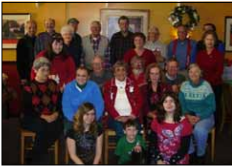
CBCs appease the editor and gather for a "photo Op" at Memories.