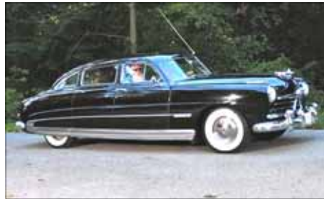
Dan White's '50 Commodore in the Hagley Museum car show parade (Dan's father's in the passenger seat).

Dan White's '50 Commodore Eight was selected to be in the parade at this year's